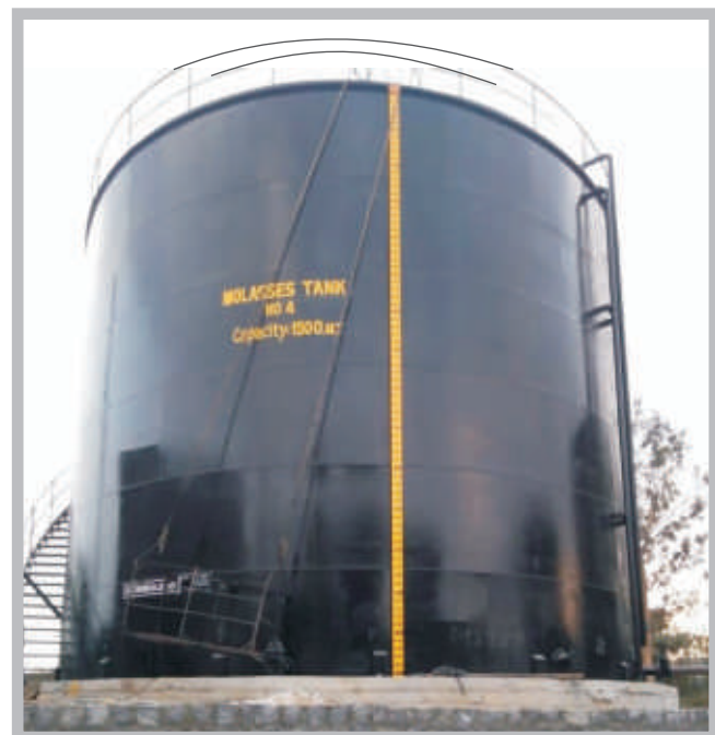
Gyan Dairy (Sp Labs) Lucknow

Molasses is a thick, dark brown liquid obtained from raw sugar during the refining process and is used as a vital ingredient in animal feed. Molasses often has a Specific gravity of 1.45. This means that 1.4 kg of molasses is 1 litre of tank capacity. This can vary and we recommend consulting your molasses supplier before deciding on the size of your tank. Molasses storage tanks are ideal for commercial and agricultural use and are used in a various type of industries. For instance, Cattle Feed Industry, Sugar Industry, Liquor industry etc.