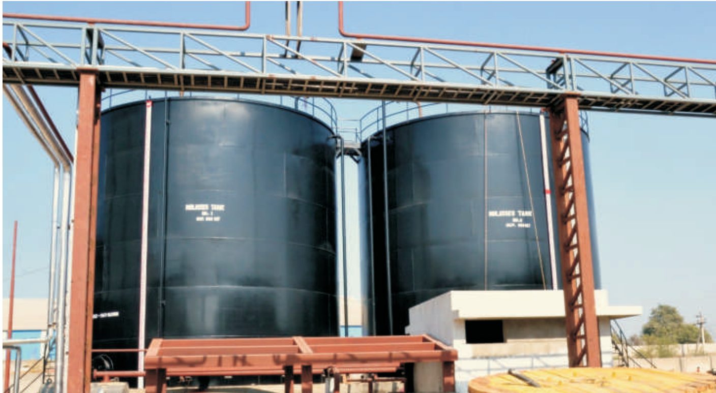
Jaipur Zila Dugdh Utpadak Sahakari Sangh Ltd- By NDDB (Anand)